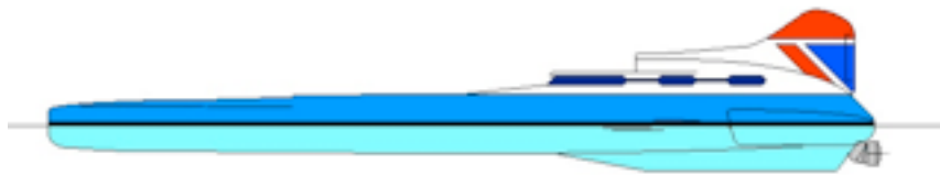
MARICUDA ATLANTIC CHALLENGER

It is the intention of south coast-based Maricuda to launch the Maricuda Atlantic Challenger, in the year of the London Olympics - 2012. Already 10 years in the planning, the 80 metre, twin gas-turbine powered trimaran is a major leap forward in design and engineering technology.